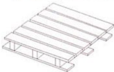
Type E Specification: 2-way entry non-reversible wing pallet