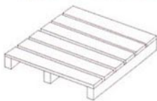
Type F Specification: 2-way entry single-face pallet